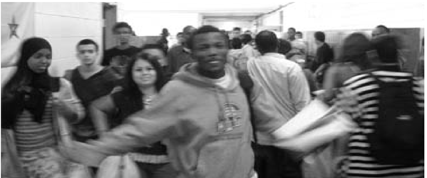
Students have more room to walk the halls during classes in the bigger building.