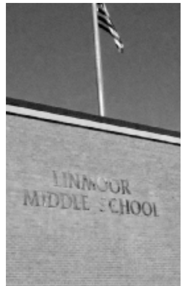
Linmoor Middle Schools is now the High School Welcome Center.