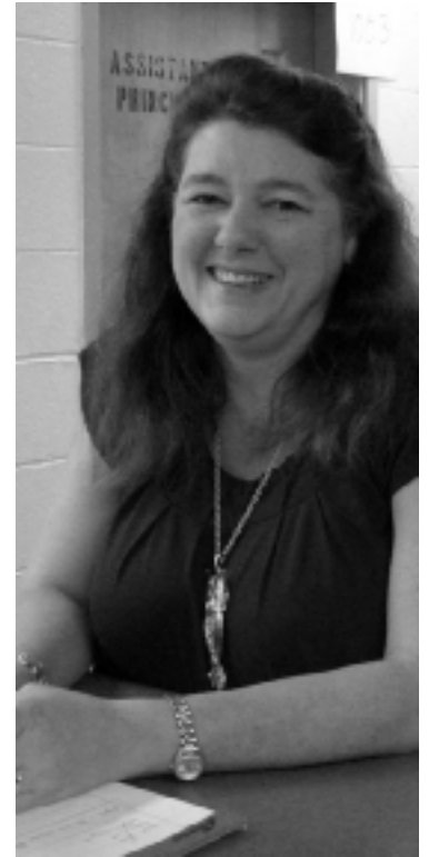
Ms. Lance told us that students need electives to graduate.

Students must have eight elective classes to graduate.