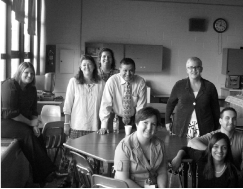
We have a great staff here and our staff spotlights will help you get to know them. Above left and right: important people you need to know!