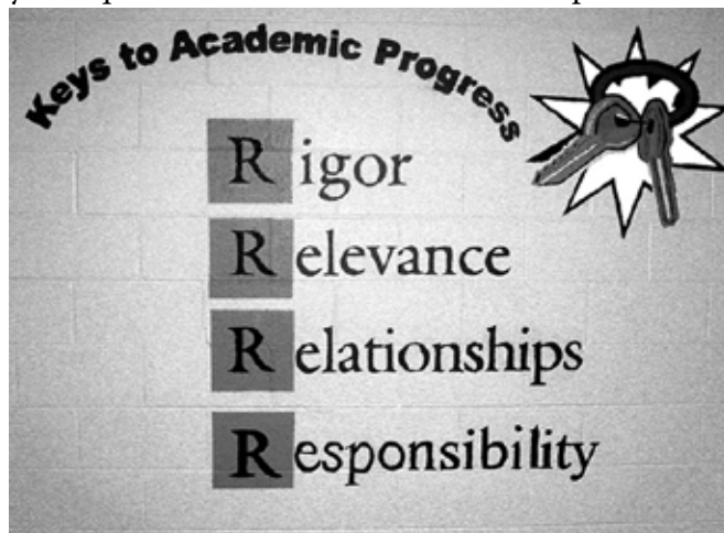
The 4 R are on the wall!

What do these words mean? We offer for you a quick definition, as found and adapted in the