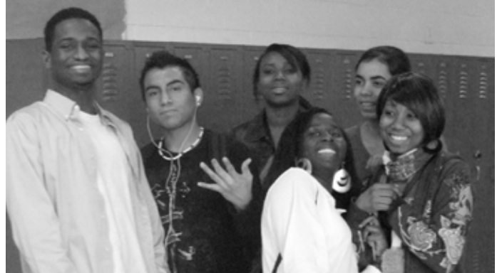
Students have a lot to do and learn before college becomes a reality.