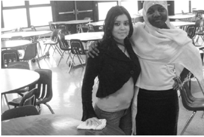
Student volunteers help clean up the cafeteria.

One of the biggest problems we have at this school is our fault. That is students not keeping the school clean. Places, such as the cafeteria, bathrooms and walls are often dirty because of student neglect.